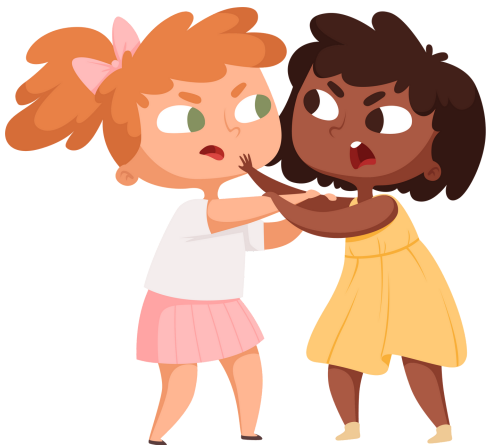
Fight with friend