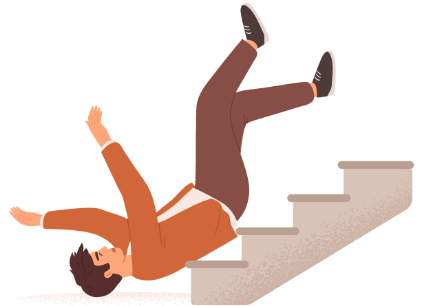
Fall down the stairs